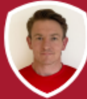
George Glenn Junior Academy Lead Coach